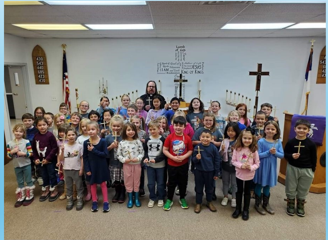
Trinity Lutheran School children

The math curriculum will give the children opportunity to combine math in their daily Christian lives that may be shared with others.